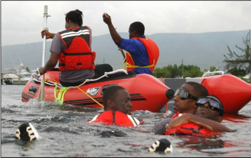
Firefighters conduct water rescue training.