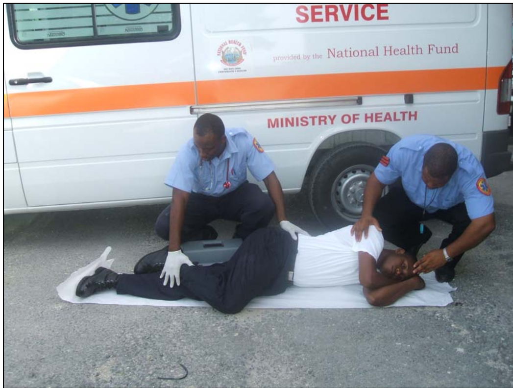
Emergency Medical Technicians at work.